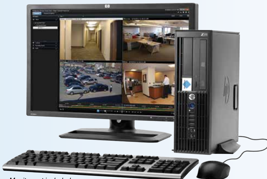
Monitor not included