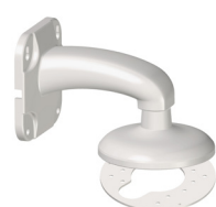
SAD013 Cable Management Wall Mount Kit