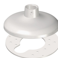
SAD012 Pendant Mount Bracket Kit