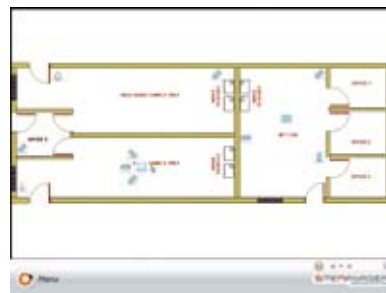
Resources can be explored and managed from site maps