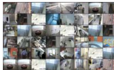
Up to 48 video streams in real time