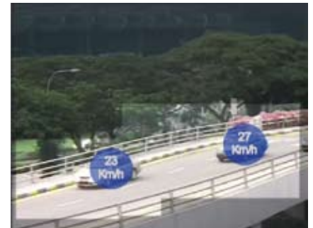
Advanced behavior analysis functionalities