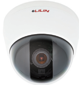
CMD 052X CMD 056X