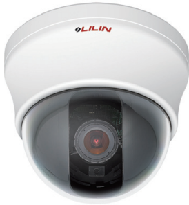
CMD 152X CMD 156X