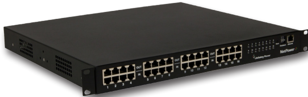
U.S. Patent 8,566,651 other patents pending