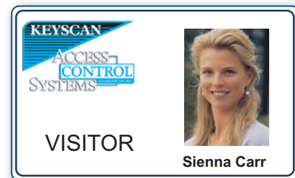
Sample Visitor Badge