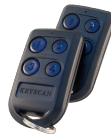
Wireless Transmitters K-TX2 K-INTX2 K-TX2-1K