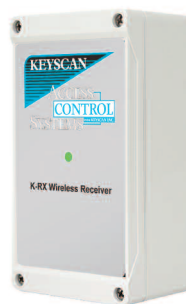
K-RX RF Receiver

Ideal for security access control applications such as securing garage or gate entries and/or exits