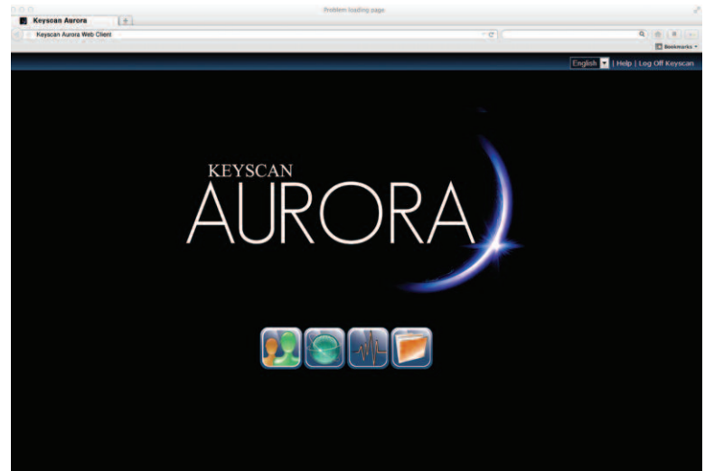
AUR-WEB Home Page

The Keyscan Aurora Web interface gives you access to People, Sites, Status and Report portals of your access control software.