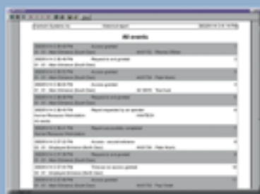
Historical Reports Extensive reporting with customizable filters