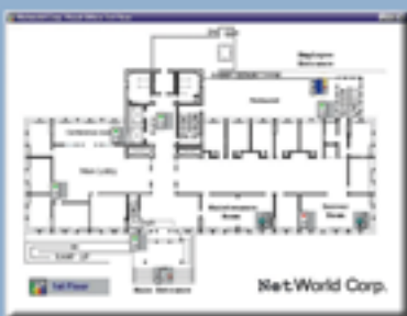
Import High-Resolution Graphics