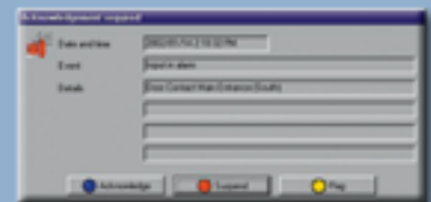
Acknowledgment Required Event acknowledgment pop-up window