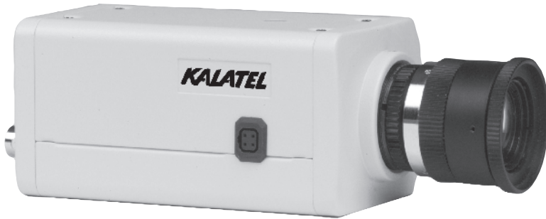
The KTC-210C lets you use C- and CS-mount lenses.

The KTC-210C is a general-purpose color security camera that offers 380 lines of resolution and high sensitivity (.05 lux). The KTC-210C lets you use C- and CS-mount lenses. The KTC-210C's automatic backlight compensation prevents important foreground objects from becoming silhouetted against bright backgrounds.