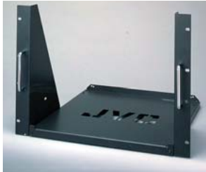
RK-C1700E ■ EIA Rack Mount Adapter

Design and specifications subject to change without notice.