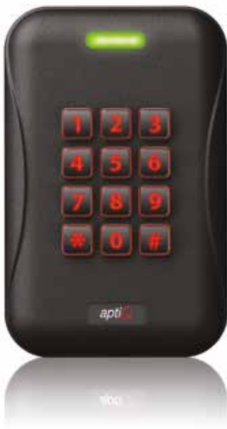
aptiQ™ Multi-Technology Single Gang Reader with Keypad

Our readers use an open architecture design following ISO 14443 standards and Wiegand protocol for interoperability with many popular access control systems.