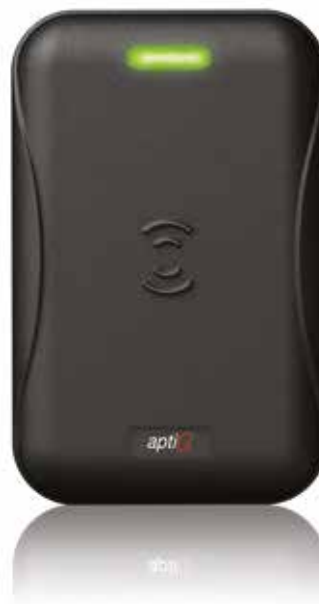
aptiQ™ Multi-Technology Single Gang Reader