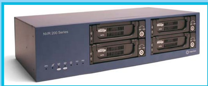
NVR RA1000 / RA1500 / RA2000 / RA3000 with RAID

The NVR 200 Series provides a powerful and integrated recording and playback system for video and audio from transmitters and receivers, with a choice of integrated or removable disks.