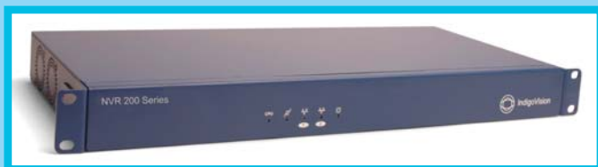
NVR FD500 / FD1000 / FD1500 with integrated disks

The Networked Video Recorder 200 Series is part of IndigoVision's complete IP Video product suite. This suite also includes a comprehensive range of transmitters and receivers and Control Center Enterprise IP Video and alarm management software.