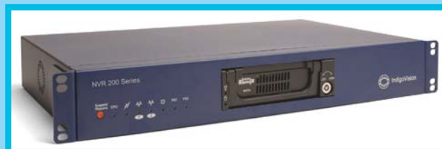
NVR RD250 / RD500 / RD750 with removable disk

Each NVR in a system can simultaneously record and play back pictures at full frame rate. NVRs are managed and configured by the Control Center application. Video can be played back to PCs, analog monitors and standard VCRs.