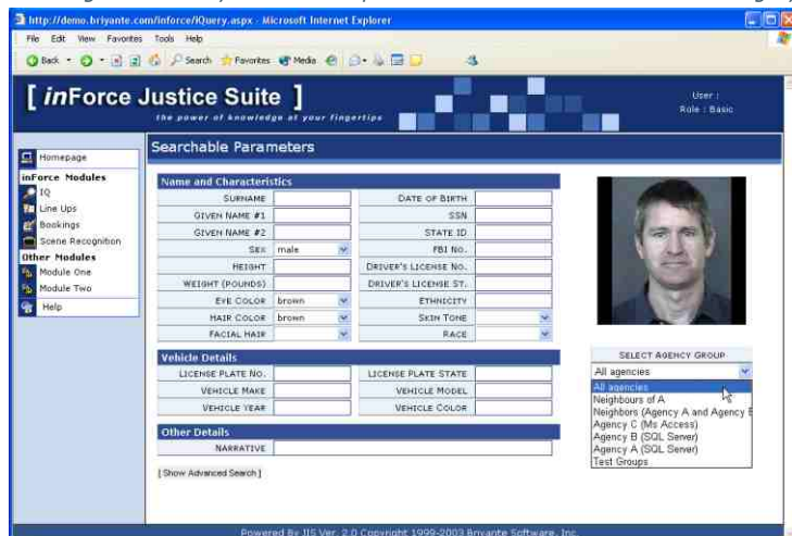
Figure 1. Easily search multiple data sources for both text and imagery