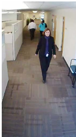
Vertical Field of View with Corridor Mode

Interface . . . . .10/100Base-TX Ethernet Port RJ-45 LED Indicators . . . . .Power/Network Supported Protocols . . . . .TCP/IP, IPv4, TCP, UDP, HTTP, FTP, DHCP, WS-discovery, UPnP, DNS, mDNS, DDNS, RTP, Unicast, Multicast, NTP, IETF NTP, SMTP, WS-Security