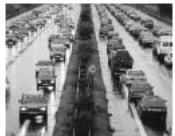
In black & white video(0.015 lx)