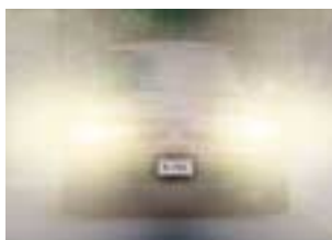
Spot BLC ON