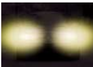
Spot BLC OFF

The camera features a high-sensitivity on-chip lens CCD to provide a smear level of -126dB. Appropriate video can be attained even when, for example, a car headlight is directly captured at night.