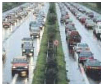
In color video(0.15lx)