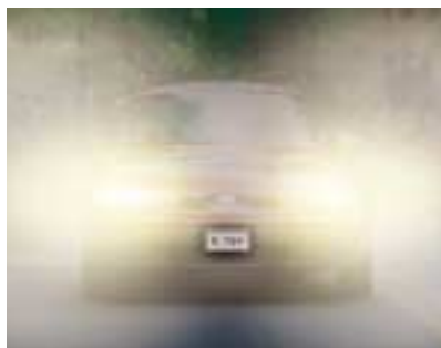
■ Spot BLC ON