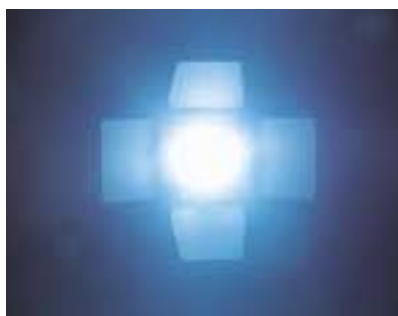
■ ICD-808/808P • ICD-828/828P