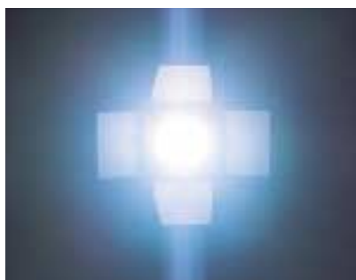
■ Conventional Models