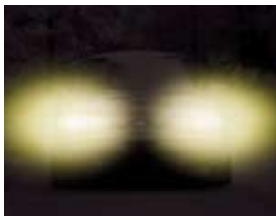
■ Spot BLC OFF

The ICD-808/808P(1/3" CCD) and ICD-828/828P(1/2" CCD) employ a high-sensitivity on-chip lens CCD. The smear level is -110dB for the IDC-808/808P, and -126dB for the ICD-828/828P. They also achieve a high sensitivity with a minimum subject illumination of 0.5 lx/F1.4 for the ICD-808/808P, and 0.15 lx/F1.4 for the ICD-828/828P. These cameras are ideally suited for outdoor surveillance, such as traffic monitoring.