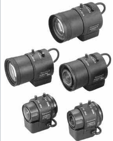
Aspherical Vari-focal Lenses