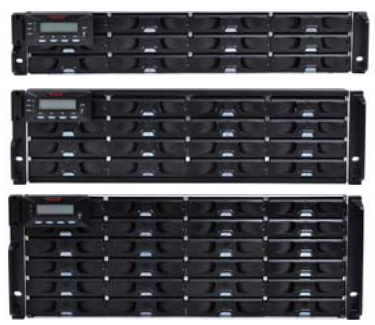
Front View - SAS RAIDs