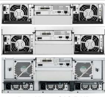
Rear View - SAS RAIDs