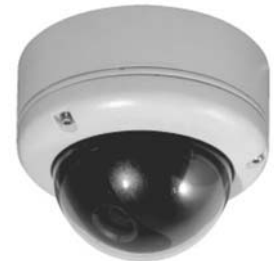
HD4CHX shown with mount ring for surface mount