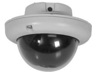
HD4CHX shown without mount ring for flush mount