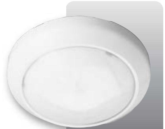
Ceiling Mount Motion Sensor