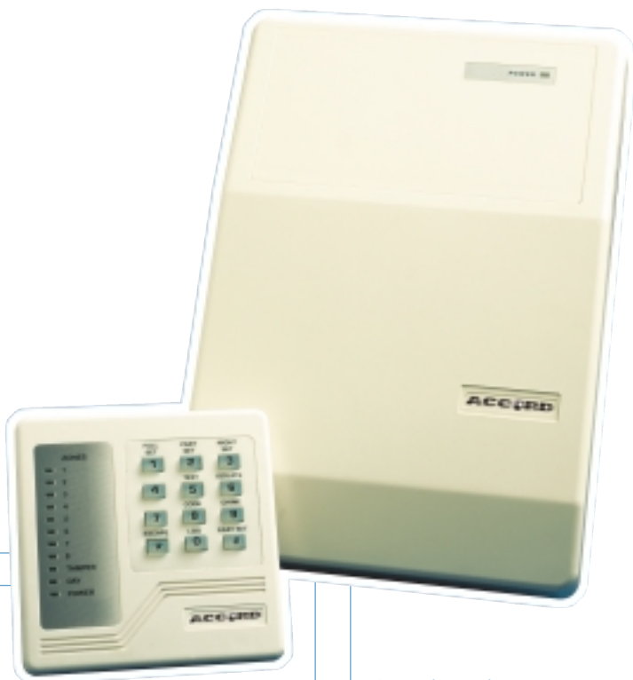
Accord panel dimensions: 196mm x 285mm