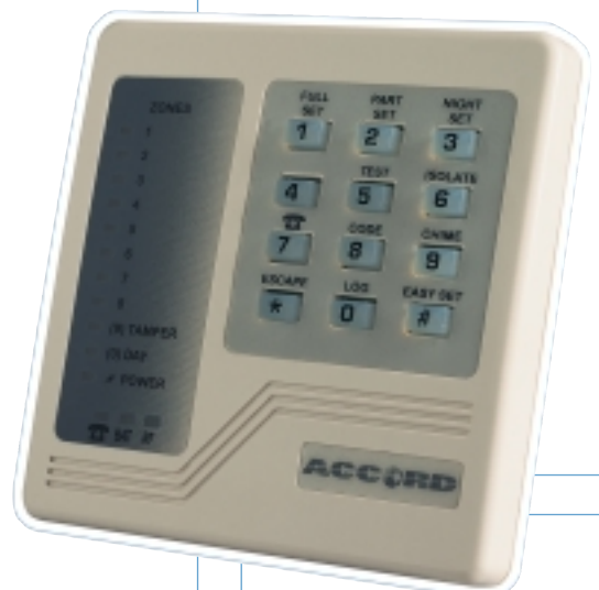
LED keypad dimensions: 119mm x 119mm