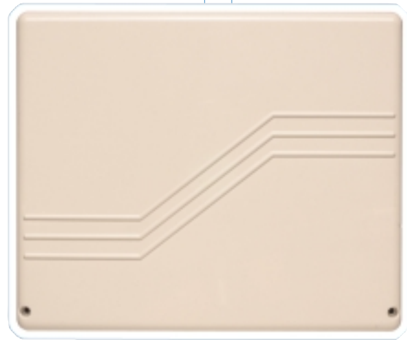
xpC control panel

Unsetting the system is achieved by simply entering the personal security code.