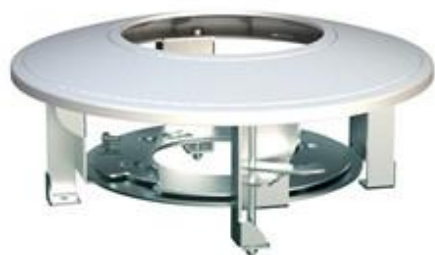
Indoor in-ceiling mount DS-1227ZJ