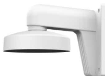
Indoor wall mount DS-1273ZJ-130