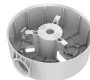
DS-1280ZJ-PT3 Junction box