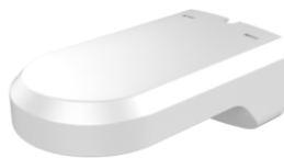
DS-1294ZJ Wall Mount