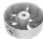
DS-1280ZJ-PT3 Junction box