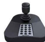
DS-1005KI USB Joy-stick