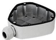
DS-1280ZJ-DM25 Junction box