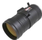
HV1140D-8MPIR 11~40mm DC Iris Lens