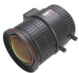
HV3816D-8MPIR 3.8~16mm DC Iris Lens