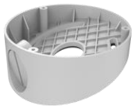
Inclined Ceiling Mount DS-1259ZJ