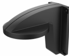
Wall Mount DS-1258ZJ(Black)