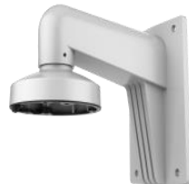
Wall Mount DS-1272ZJ-110