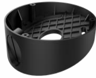
Inclined Ceiling Mount DS-1259ZJ(Black)