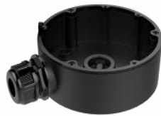
Junction Box DS-1280ZJ-DM18(Black)