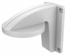
Wall Mount DS-1258ZJ