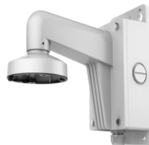
Wall Mount + Junction Box DS-1272ZJ-110B