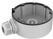
Junction Box DS-1280ZJ-DM18