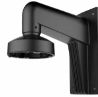
Wall Mount DS-1272ZJ-110(Black)