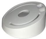
Inclined ceiling mount