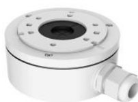
DS-1280ZJ-XS Junction Box