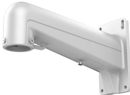
DS-1602ZJ Long-arm Wall Mount Bracket