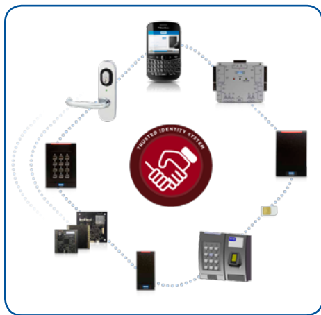
iCLASS SE® Platform