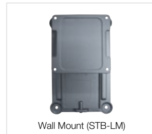
Wall Mount (STB-LM)