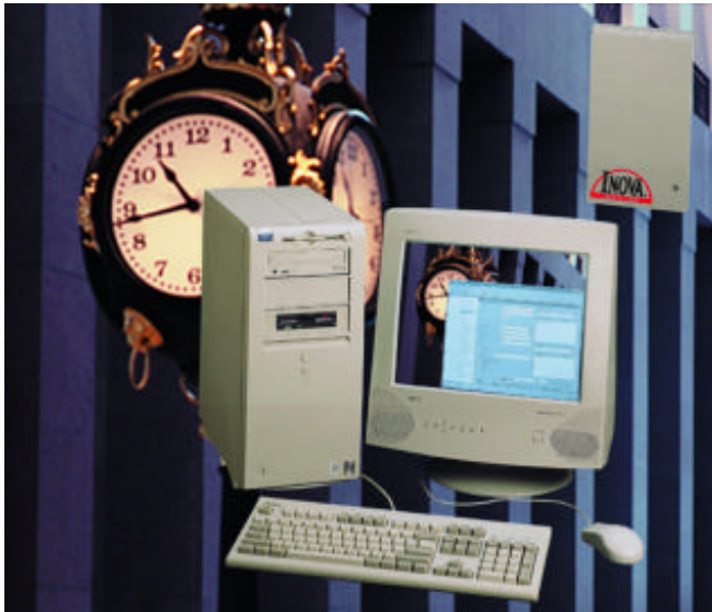
ACCESS CONTROL ADMINISTRATION AND REPORTING SOFTWARE SUITABLE FOR MULTI-DOOR ACCESS CONTROL APPLICATIONS IN COMMERCIAL AND INDUSTRIAL APPLICATIONS