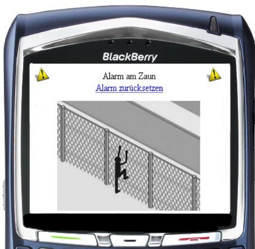
Direct alert to a terminal: The security personnel decide what steps to take next

Netzlink works with leading partners from different specialised areas. The advantages of the BlackBerry Enterprise Solution are effectively combined with innovative fence technology by Haverkamp GmbH and intelligent camera technology by Geutebrück GmbH. The integration of security technology with mobile clients opens up a wide range of possibilities for expanding existing security concepts in an effective way. The modular design of the deployed components enables us to produce solutions tailor-made to your needs.