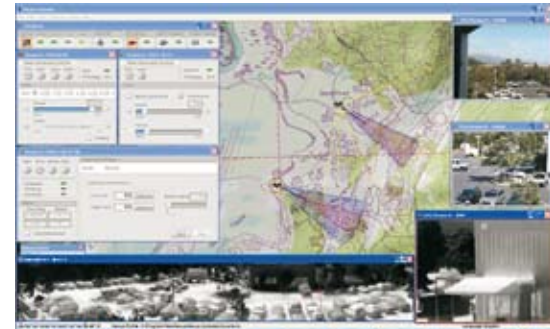
Example of a Graphical User Interface developed with the Software Developers Kit.