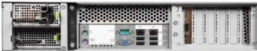
Back view of the FLIR nDVR