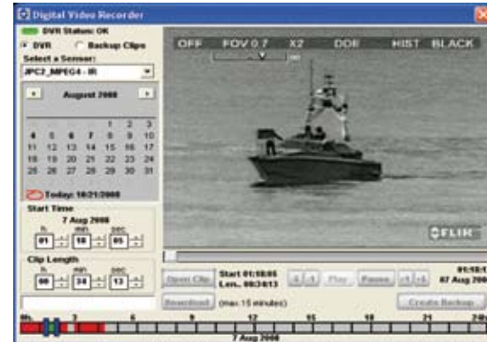
FLIR's Nexus SDK and Sensors Manager offer comprehensive interfaces for end-users to manage stored content.