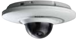
N233ZC / N233ZCP 1.3MP Micro PT Dome IP Camera