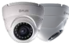
N133ED-2 2.1MP Fixed IR Dome IP Camera 2 Pack