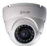
N133ED/P 2.1MP Fixed IR Dome IP Camera