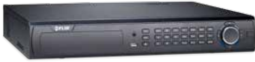
M4400 / M4400P Series