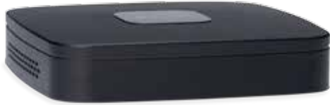
DNR110 Series / DNR110P Series*