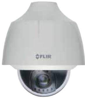
C336ZC1/P MPX PTZ Camera