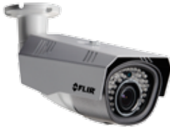
C237BC / C237BCP 1.3MP HD Motorized Varifocal WDR Bullet MPX Camera

The FLIR 1.3MP HD Varifocal WDR Bullet MPX Cameras use the latest HD-CVI technology and True WDR to deliver excellent 720p picture quality over coax cabling in any lighting condition. Ideal for retrofit applications, the cameras are compatible with FLIR MPX DVRs offering an upgrade to HD resolution without the hassle of running new cables. Dual video output offers simultaneous HD and 960H video streams. The C237 series adds the ability to remotely adjust zoom and focus.