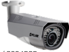
C234BC / C234BCP 1.3MP HD Varifocal WDR Bullet MPX Camera