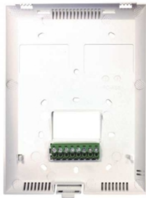
DUOX VEO-XS MONITOR CONNECTOR