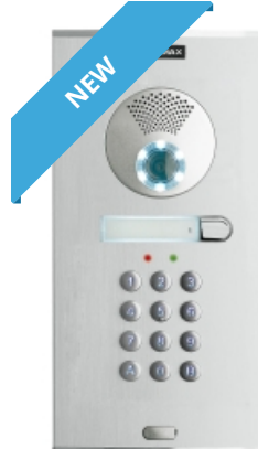
1/W COLOUR DUOX MEMOVISION CITY PANEL