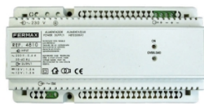
P.S.U. DIN10 230VAC/12VAC+18VDC- 1.5A