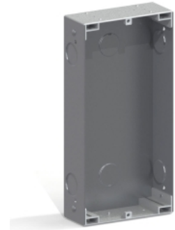
CITY FLUSH BOX S5