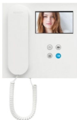
COLOUR DUOX VEO MONITOR 4,3"