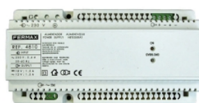
P.S.U. DIN10 230VAC/12VAC+18VDC- 1.5A