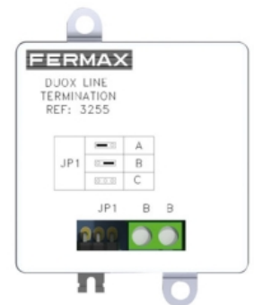
DUOX LINE ADAPTOR