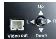
Socket for service cable Setup - Joystick