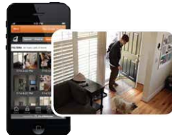
Innovative Mobile and Web Visual Views