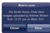
Industry Leading Alarm.com Interactive Services