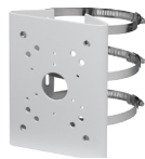
PFA150 Pole mount